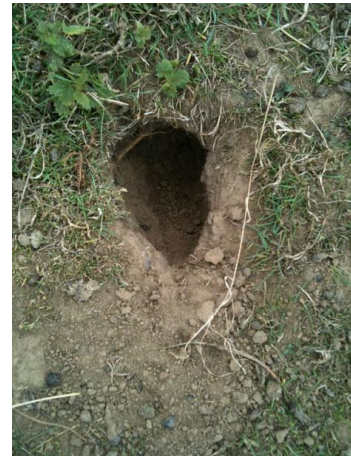
Rabbit Holes on Fairways