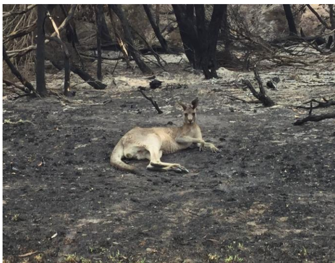
Back of the 3 rd Green

To give members some idea of the problems faced by the Committee of Management, the following photos have been provided. Nevertheless, we are very confident with all the help being given to the club that the course will bounce back better than ever. Further, the COM has plans to capitalise on this misfortune by implementing improvements to the course.