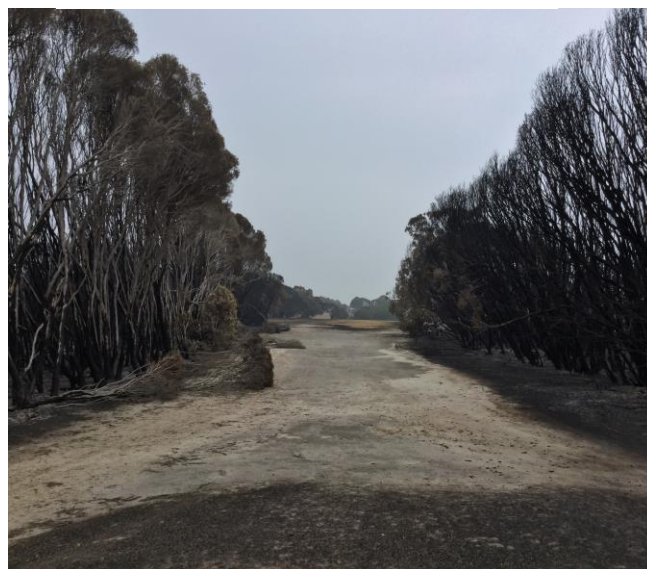
View from the men's 9 th Hole tee off