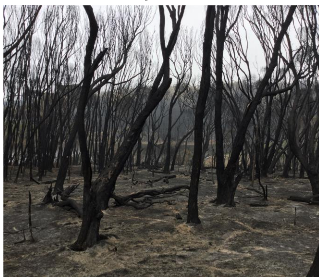
View between 8 th and 9 th fairways